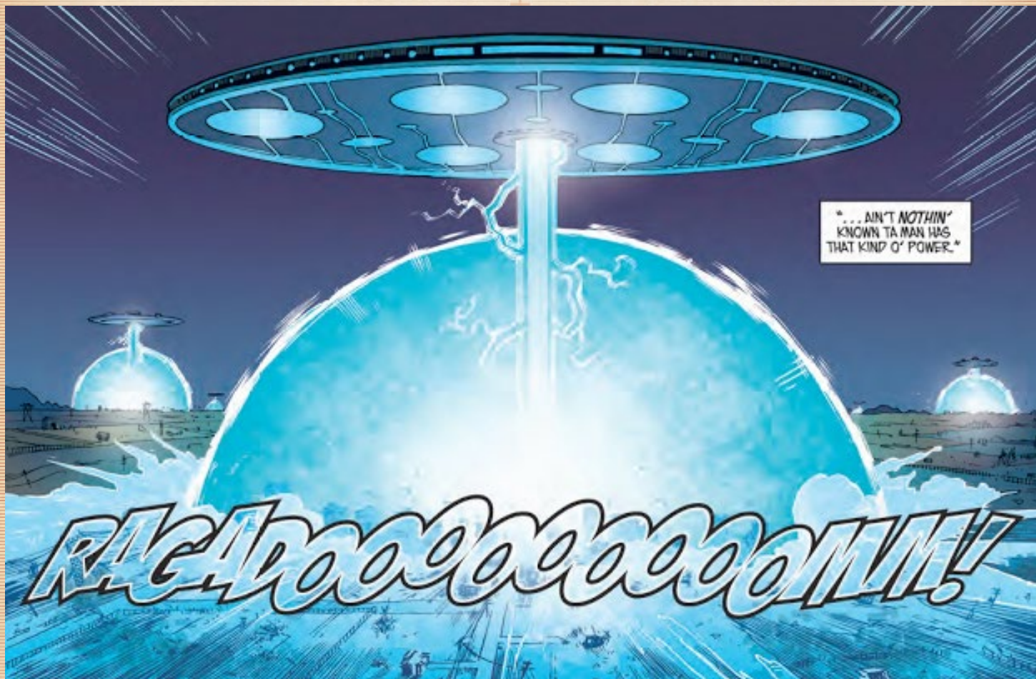
Tetaldian motherships in action! Each one carries multiple attack saucers and squads of automatons. See the Fear Agent™ roleplaying game for all the grisly details!

These ships form the vanguard of Tetaldian invasion fleets. They fulfill multiple roles: escort, ground support, and troop transport. They carry enough armament to be a match for most warships their size, while still maintaining the capability to soften up ground defenders and deliver terrifying units of automatons to the front lines.